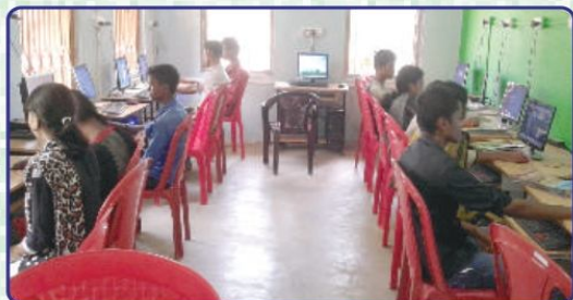
IT Practical Lab