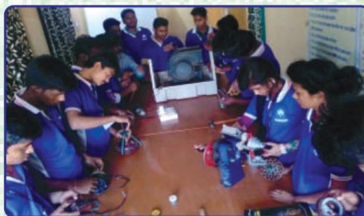
Home Appliances Practical Training