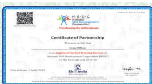
Training Partner Certificate for 2019-2020 FY