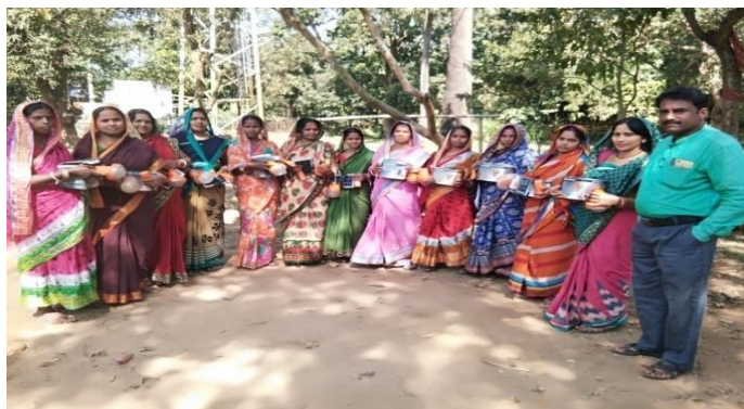
Initiative towards Clean Energy Solution

Since December 2016, Gram-Utthan has started promoting solar lights through the financing of Milaap Social Ventures Pvt. Ltd. in the remote and inaccessible villages of operational districts. The task of Gram-Utthan is to identifying the families in need and providing appropriate affordable clean energy solutions for lighting and cooking at household and community level. Gram-Utthan also develops and implements a self-financing model for dissemination and distribution of the energy solutions at the household level (e.g. linking with SHGs, Banks, and Government Schemes etc.).