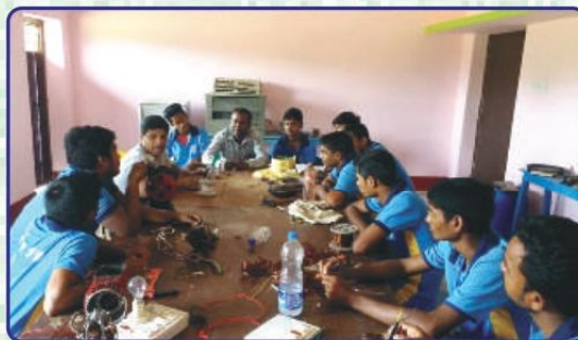
Motor winding Practical Session