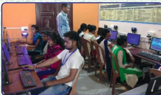
IT Practical Lab