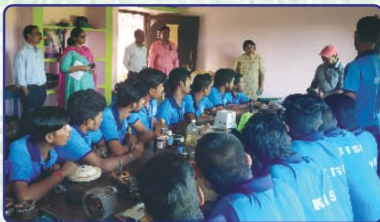
Electrical Practical session