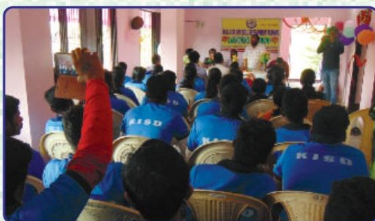
Secretary, GU interacts with Trainees